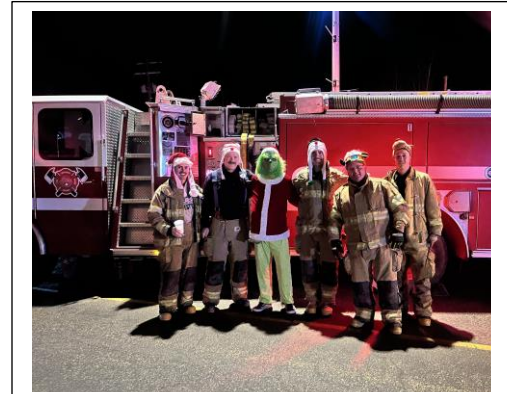
North West Fire Rescue had fun

TELMATIK - The Town of Onoway has an automated messaging service to help advise all citizens quickly and efficiently in case of emergency and/or public notification (ex. temporary interruption of the water supply, tax payment deadlines, snow removal, election dates, town events etc.). This system allows us to notify residents by landline and/or cellular and/or SMS and/or email of your choice. Please visit our website www.onoway.ca and following the link provided under the Emergency Services Tab "Alert and Notification System" to assure your contact information is added. Please note that the Alert and Notification System is secure and resident contact info. will only be used by the Town of Onoway to contact residents regarding important information.