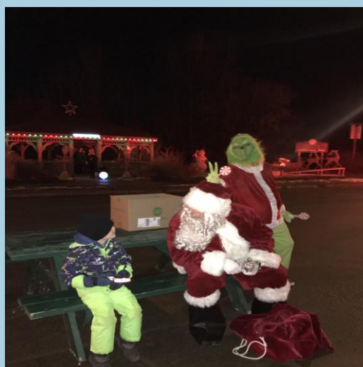
The Grinch photobombing Santa as he's chatting with a youngster

Be sure to check your home insurance policy or talk to your insurance agent about what exactly your policy covers and the amount of your coverage.