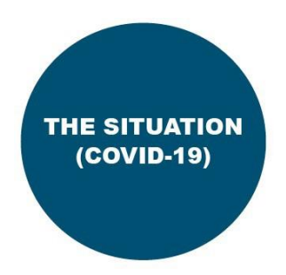
Instead of this anxious

Extra layers of anxiety get added to the onion when you are thinking and behaving in unhelpful ways. Lack of routine, isolation, checking behaviours, over-exposure to the media, and unhelpful worry or rumination add extra layers to your anxiety onion.