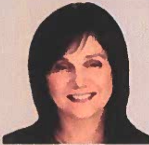
ADRIANA LAGRANGE Education Minister